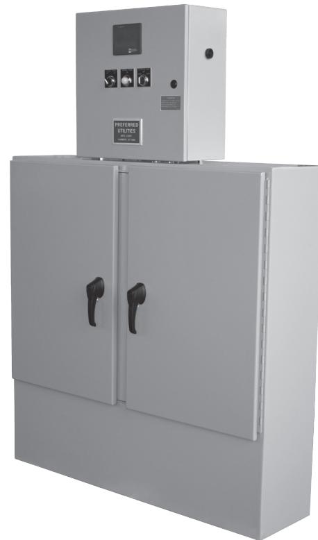
Model PF Automatic Fuel Oil Filtration Set

The separated contaminants and water are monitored by an integral filter water level detector. Depending on the size of the system, this waste water is piped to an optional Waste Water Holding and Removal System or connected directly to the customer's waste tank (by others). A differential pressure switch/ indicator is installed around the filter units to provide a visual indication of filter element condition. An alarm notifies plant personnel when the filter elements require replacement.